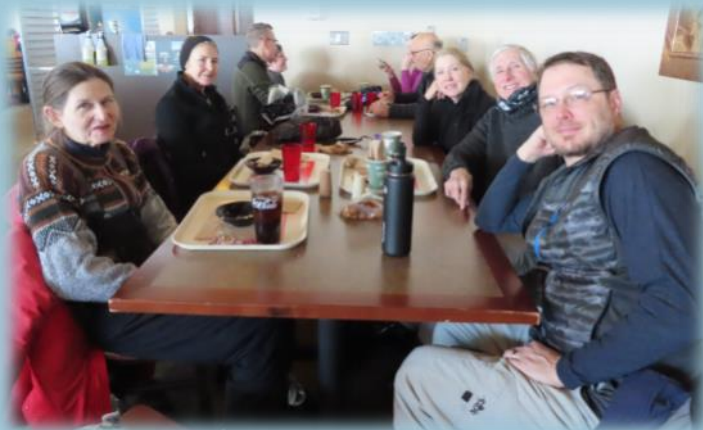
Whew...we need a Break!!!