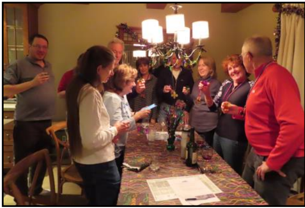
The Armadillo Toast - "Here's To It..."