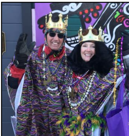
The Royals in crown & gown