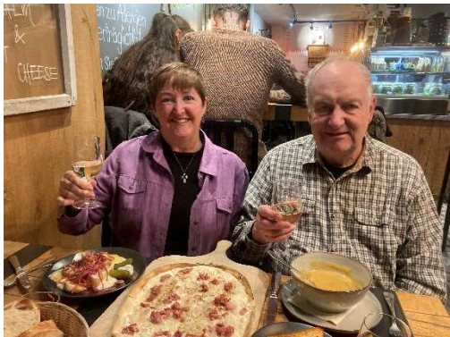
We found some more great places to eat.

Sunday brunch on a lake tour boat was fabulous. Weather in town stayed just above freezing during the day, and there was very little snow in town.