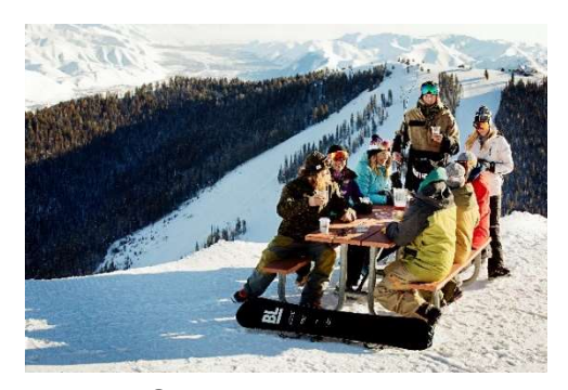
Sun Valley Website: <a href="https://www.sunvalley.com">https://www.sunvalley.com</a>