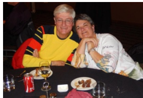
As usual, the final TSC party was a good time!