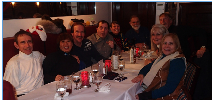
Dinner at Café de la Paix

Dining out was consistently rewarding activity. We visited a new restaurant every day and were always pleased with the high quality of the food and reasonable prices. Our midweek club dinner at Le Continental was the high point. We were provided our own private room with dedicated wait staff, fine French food and exquisite service. And after ordering the cheapest bottles of wine on their list we were happily surprised at how the quality greatly exceeded our expectations. Having spent less money than we expected we had another club dinner on Saturday night at a small cafe near the hotel.