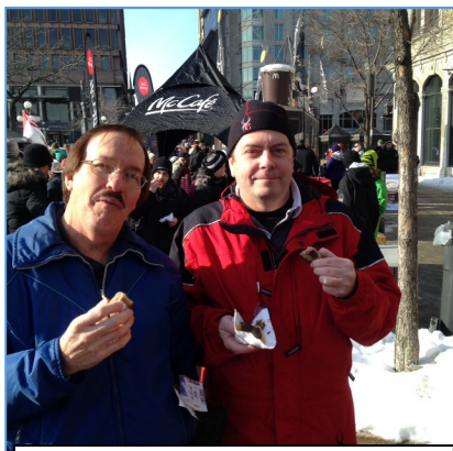
Free breakfast at the Carnival! and workout facility every day.

Others participated in walking tours of the old city, local museums and the Winter Carnival.