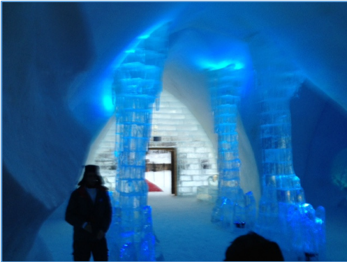
Ice Hotel entrance

Another favorite activity was a visit to the Ice Hotel.